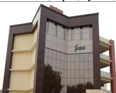
Delhi Institute of Higher Education Plot No. 20 C, Techzone – IV, Noida Extension (U.P.)