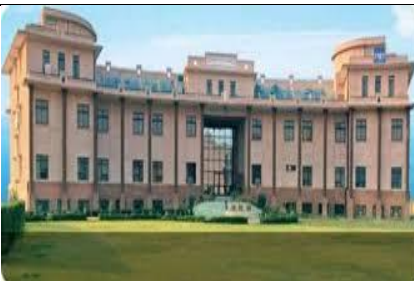
Jagannath Gupta Institute of Engg. & Technology Plot No. IP 2 & 3, Phase-IV, Sitapura Indl. Area, Jaipur (Rajasthan)