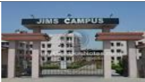
JIMS Engineering Management Technical Campus Knowledge Park-III, Greater Noida, U.P.