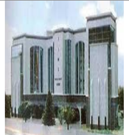
Jagannath Institute of Management Sciences JIMS Vasant Kunj-II, Plot no- 3, Institutional Area, Phase -II, Vasant Kunj, New Delhi