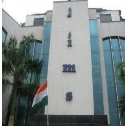
Jagannath International Management School OCF, Pocket-9, Sector-B, Vasant Kunj, New Delhi