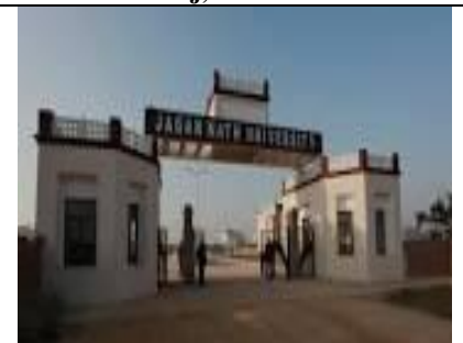
Jagannath University BahadurGarh (Haryana)