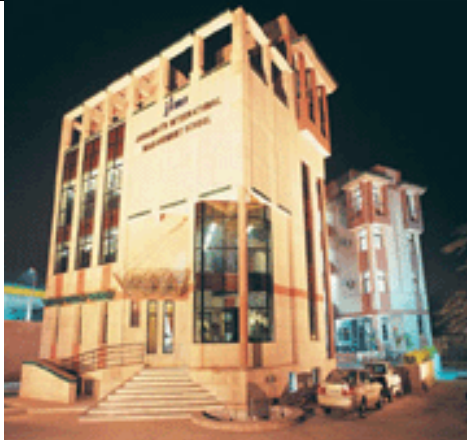
Jagannath International Management School MOR, Pocket 105, Kalkaji, New Delhi