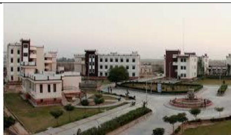
Jagannath University Village Rampura, Tehsil Chakshu, Jaipur (Rajasthan)