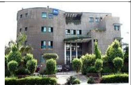
Jagan Institute of Management Studies 3, Institutional Area, Sector-5, Rohini, New Delhi