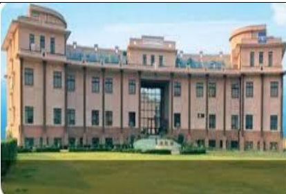
Jagannath Gupta Institute of Engg. & Technology Plot No. IP 2 & 3, Phase-IV, Sitapura Indl. Area, Jaipur (Rajasthan)