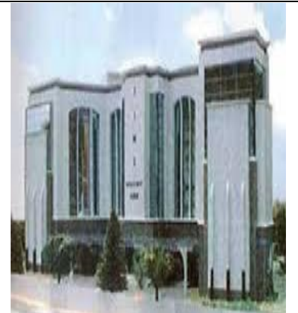
Jagannath Institute of Management Sciences JIMS Vasant Kunj-II, Plot no- 3, Institutional Area, Phase -II, Vasant Kunj, New Delhi