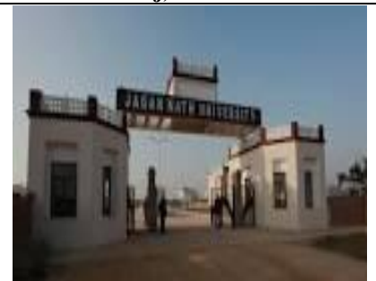
Jagannath University BahadurGarh (Haryana)