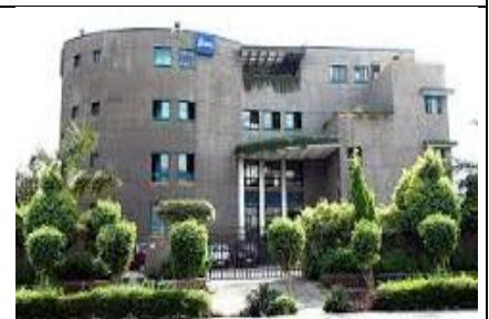
Jagan Institute of Management Studies 3, Institutional Area, Sector-5, Rohini, New Delhi