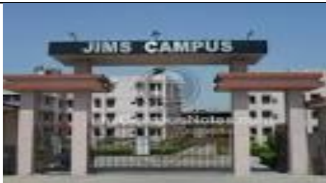
JIMS Engineering Management Technical Campus Knowledge Park-III, Greater Noida, U.P.