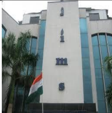
Jagannath International Management School OCF, Pocket-9, Sector-B, Vasant Kunj, New Delhi