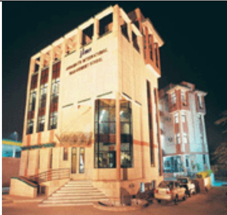
Jagannath International Management School MOR, Pocket 105, Kalkaji, New Delhi