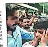
The autorickshaw driver was not only assaulted but also forced to apologise to a passenger with whom he had refused to speak in Marathi