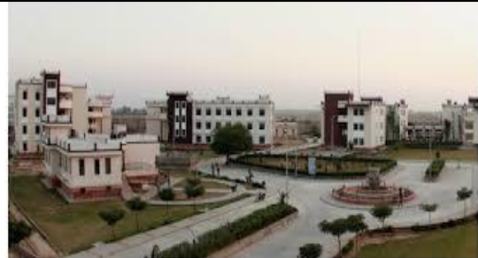
Jagannath University Village Rampura, Tehsil Chakshu, Jaipur (Rajasthan)