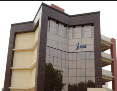
Delhi Institute of Higher Education Plot No. 20 C, Techzone – IV, Noida Extension (U.P.)