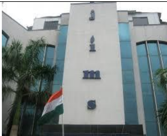
Jagannath International Management School OCF, Pocket-9, Sector-B, Vasant Kunj, New Delhi