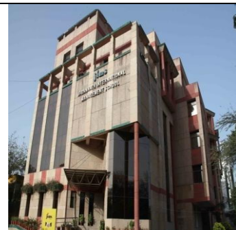
Jagannath International Management School MOR, Pocket 105, Kalkaji, New Delhi