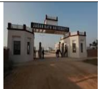
Jagannath University BahadurGarh (Haryana)