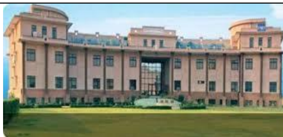
Jagannath Gupta Institute of Engg. & Technology Plot No. IP 2 & 3, Phase-IV, Sitapura Indl. Area, Jaipur (Rajasthan)