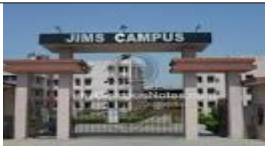
JIMS Engineering Management Technical Campus Knowledge Park-III, Greater Noida, U.P.