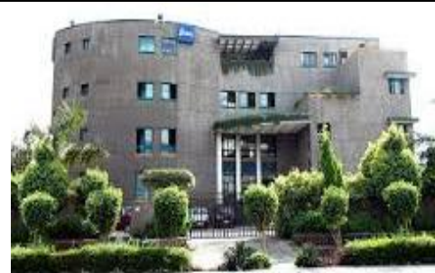
Jagan Institute of Management Studies 3, Institutional Area, Sector-5, Rohini, New Delhi