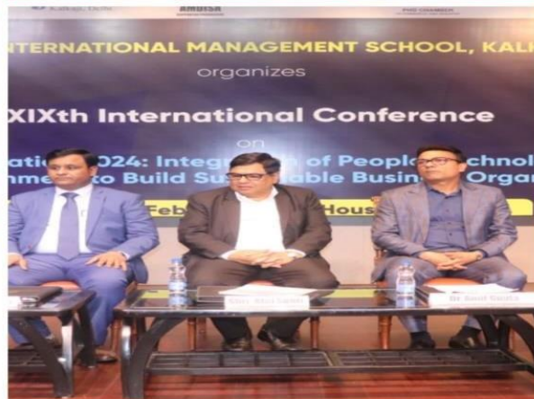
A conference on 'Transformation 2024: Incorporating People, Technology, and the Environment for Building Sustainable Business Organizations' was held on 16th and 17th February'24 at PHD Chamber of Commerce and Industry