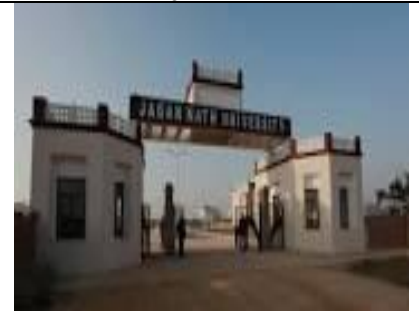
Jagannath University BahadurGarh (Haryana)