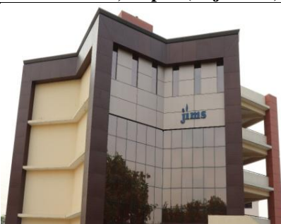
Delhi Institute of Higher Education Plot No. 20 C, Techzone – IV, Noida Extension (U.P.)