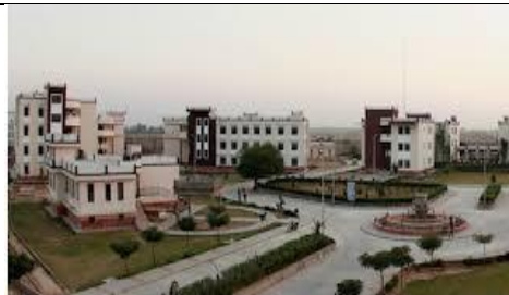
Jagannath University Village Rampura, Tehsil Chakshu, Jaipur (Rajasthan)