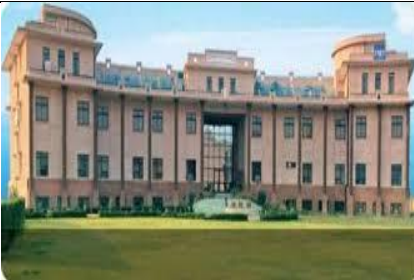
Jagannath Gupta Institute of Engg. & Technology Plot No. IP 2 & 3, Phase-IV, Sitapura Indl. Area, Jaipur (Rajasthan)