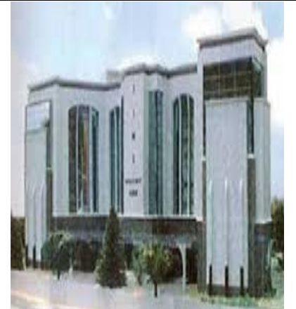
Jagannath Institute of Management Sciences JIMS Vasant Kunj-II, Plot no- 3, Institutional Area, Phase -II, Vasant Kunj, New Delhi