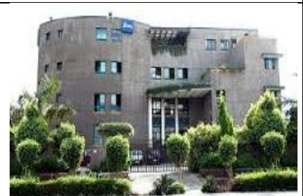
Jagan Institute of Management Studies 3, Institutional Area, Sector-5, Rohini, New Delhi