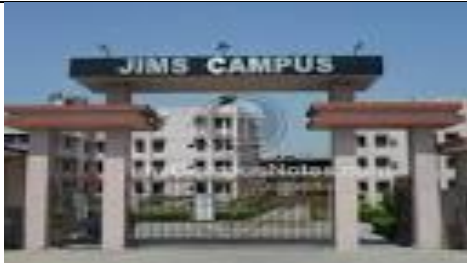
JIMS Engineering Management Technical Campus Knowledge Park-III, Greater Noida, U.P.