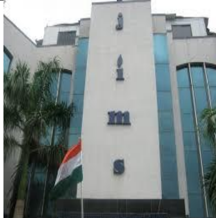
Jagannath International Management School OCF, Pocket-9, Sector-B, Vasant Kunj, New Delhi