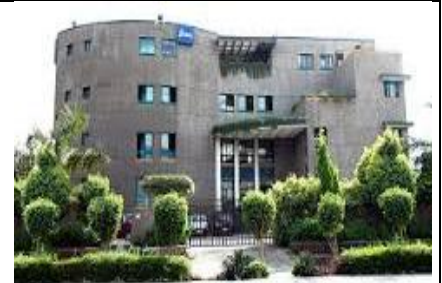
Jagan Institute of Management Studies 3, Institutional Area, Sector-5, Rohini, New Delhi