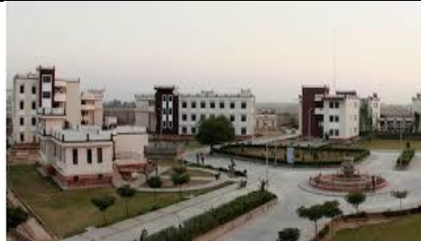
Jagannath University Village Rampura, Tehsil Chakshu, Jaipur (Rajasthan)