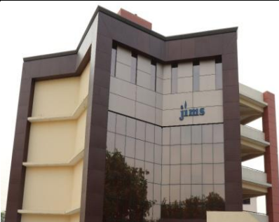
Delhi Institute of Higher Education Plot No. 20 C, Techzone – IV, Noida Extension (U.P.)